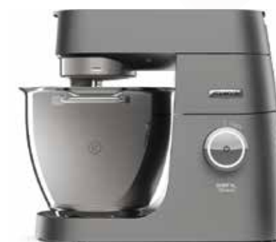
CHEF XL TITANIUM