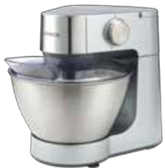
CHEF XL TITANIUM