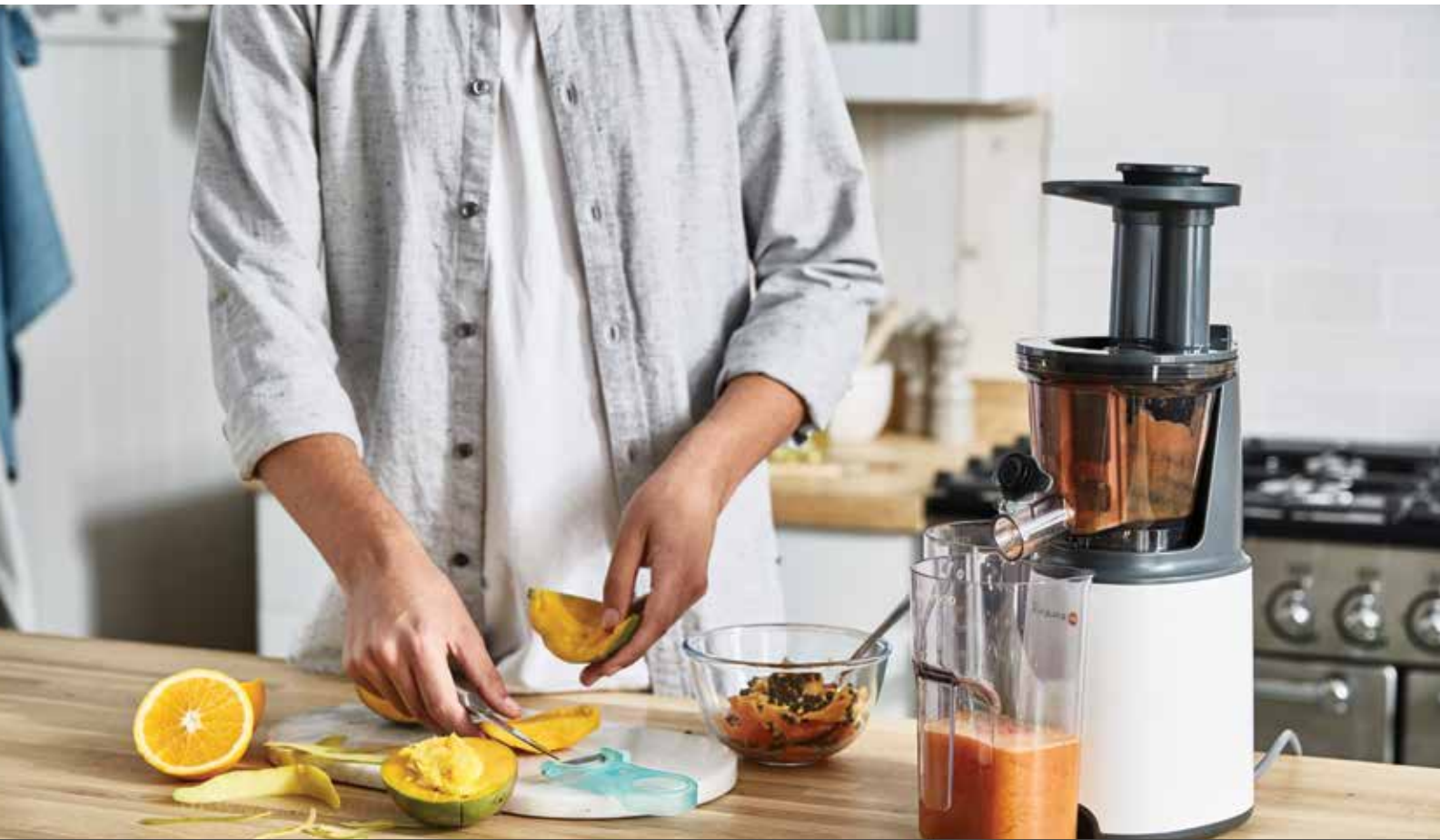
PURE JUICE ONE