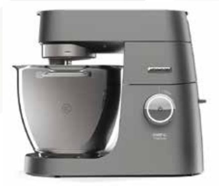
CHEF XL TITANIUM

The Kenwood Chef XL Titanium is the ultimate kitchen machine, giving you the confidence to become more ambitious and inspire your creativity in the kitchen.