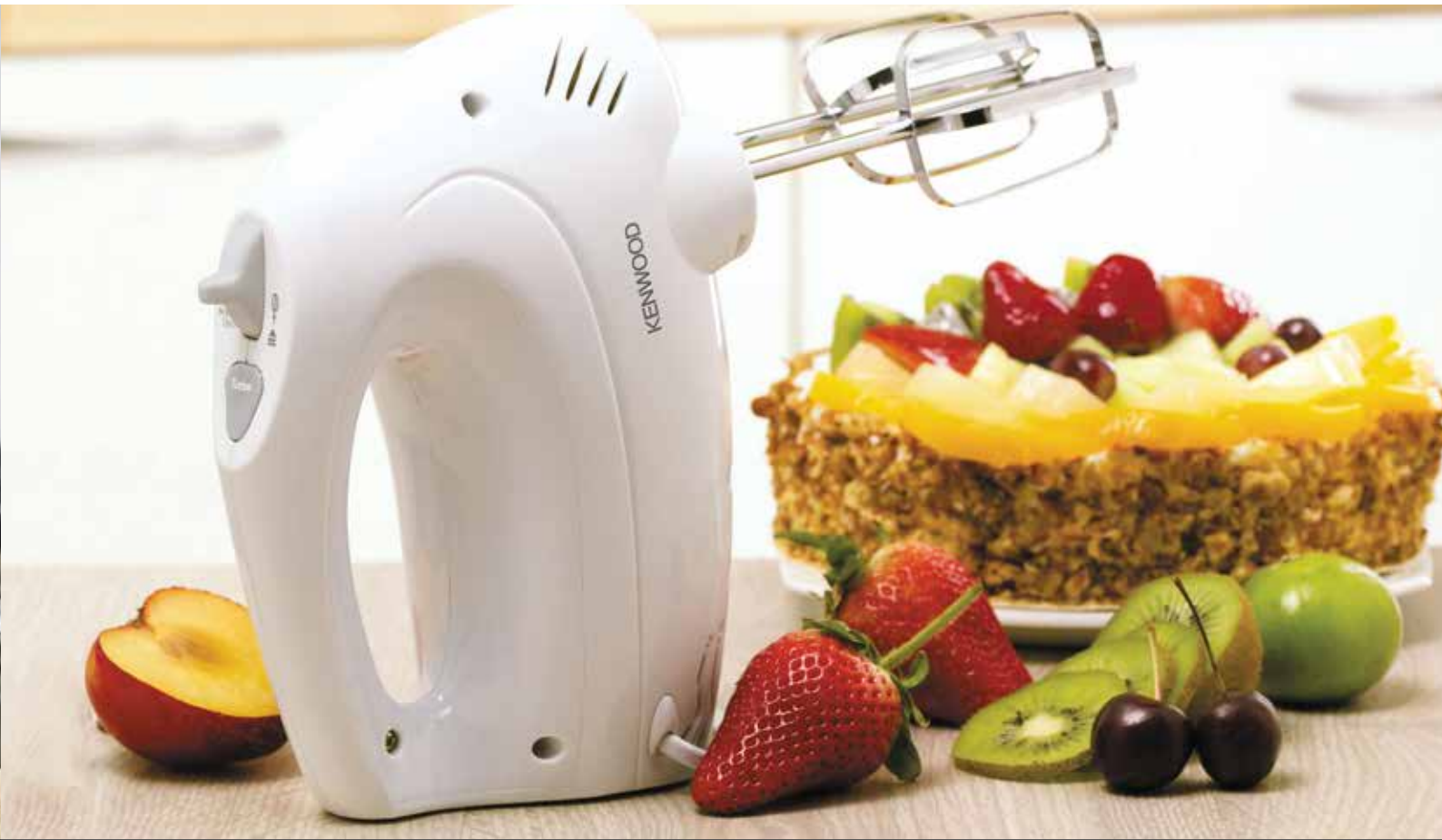
HM330 HAND MIXER