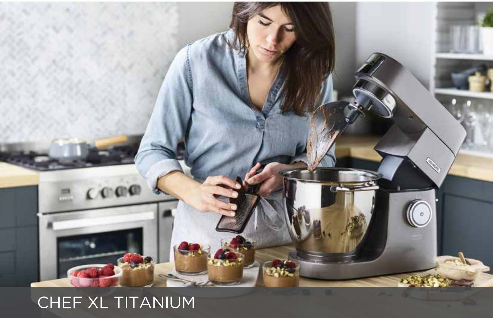
CHEF XL TITANIUM

With a Chef XL Titanium the possibilities are endless. Designed for the passionate home baker, its thoughtful features help make your creations even better. From the in-bowl illumination to better gauge your mixes, to the complete power control giving you the range to make both a perfect loaf and deliciously light soufflé.