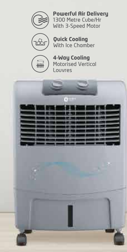
Smartcool DX 37, 24, 18 CP3701H, CP2401H, CP1801H